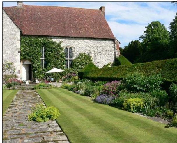
The Court House, East Meon